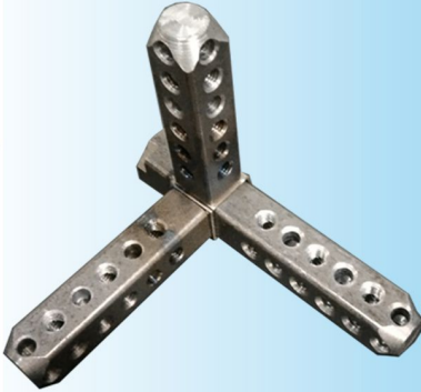
3D Rendered View