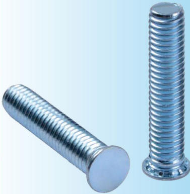
3D Rendered View