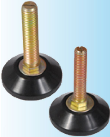
3D Rendered View