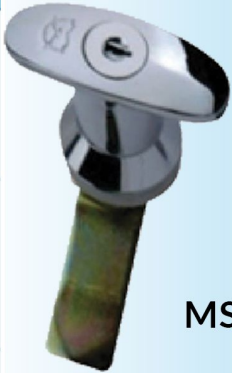
MS 302 - 1