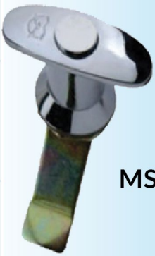
MS 302 - 2