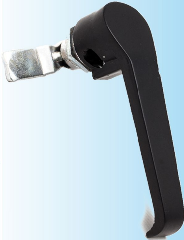
3D Rendered View