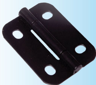
3D Rendered View