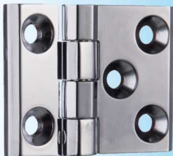
3D Rendered View